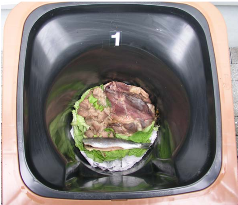
with Standard Lid