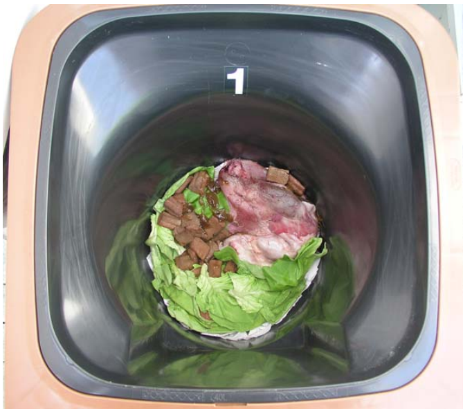
with Standard Lid