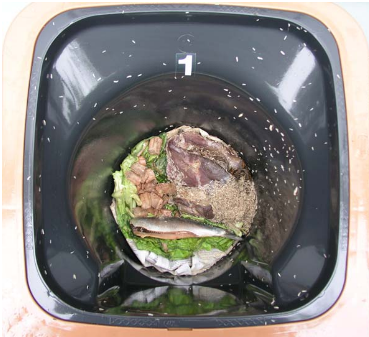
with Standard Lid