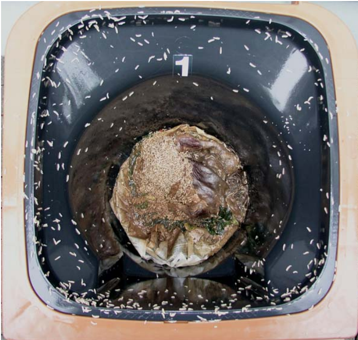
with a Bio-Filter Lid