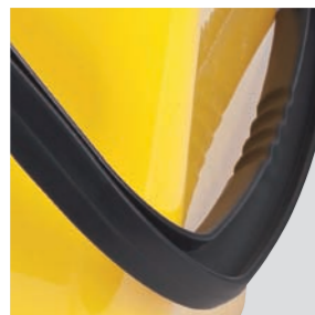
Robust handle with secure grip for working with gloves