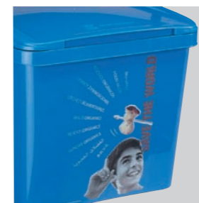
Lid or body with IML (injection moulded label – option)