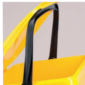
Vertical handle with two lid opening and locking positions