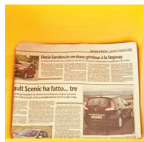
Rectangular base with optimum capacity for newsprint